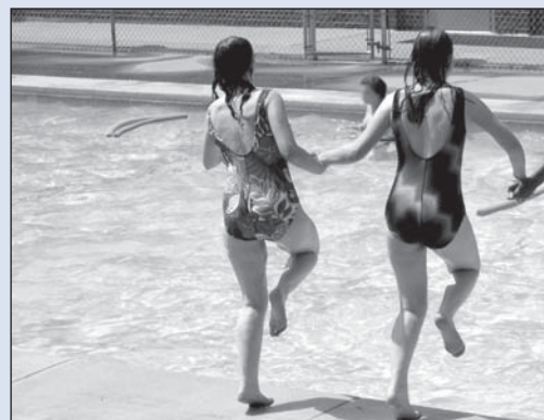
Ozanam girls latch hands before jumping into the pool during one of the hottest days in June. The pool is a very popular place on campus during the summer months, and each dorm unit has scheduled swimming times throughout the week. Boys and girls have fun exercising and staying cool.