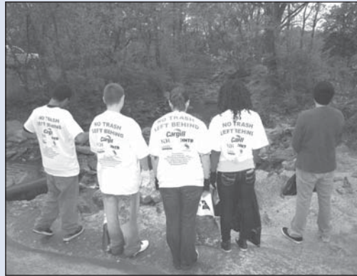
On April 22nd for Earth Day, Ozanam students picked up trash along the Blue River as part of KC Clean Streams, a program created and led by the Blue River Watershed Association (BRWA). This program educates the city's youth about keeping the Blue River Watershed clean.

confidence levels. After surviving so many hardships and challenges, these new experiences at Ozanam can become some of the happiest memories of their childhoods. After all, they deserve to be carefree kids for awhile. ■