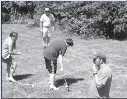
Staff members offer encouragement as an Ozanam boy learns how to play croquet. On May 27th, the Cultural Enrichment Committee planned a "May Day" event to celebrate the beginning of summer that included croquet, bean bag tosses, basketball games, a cupcake walk, a concert and cookout.