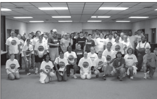
Day of Caring volunteers from Sprint, Garmin, KPMG, and Cleveland Chiropractic College rally together in Smith Hall on June 5th before beginning their projects. They cleaned, painted and landscaped campus.