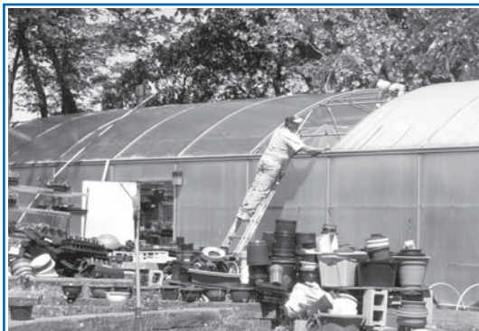
Contractors replace the damaged roof of the Ozanam greenhouse so that more sunlight can enter. This repair was made possible with support from our volunteers and donors. Thank you!

Now that more sunlight can enter the greenhouse, the boys and girls have noticed an improvement in the growth of their plants. They recently held the Annual "Thyme for Kids" Plant Sale, which raised a record $13,000! Thank you for supporting our youth and their activities. ■