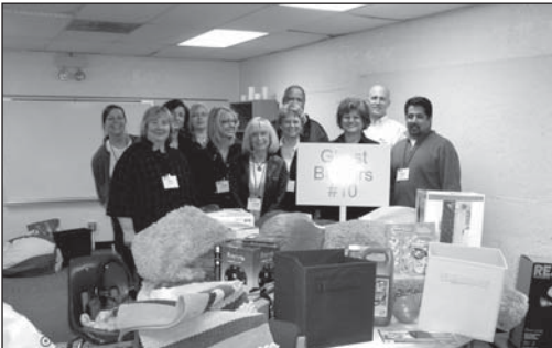
A group from Teva Neuroscience visited Ozanam on March 26th and transformed an empty classroom into the start of a new sensory room. They donated specific items designed to sooth students with Asperger's Syndrome.