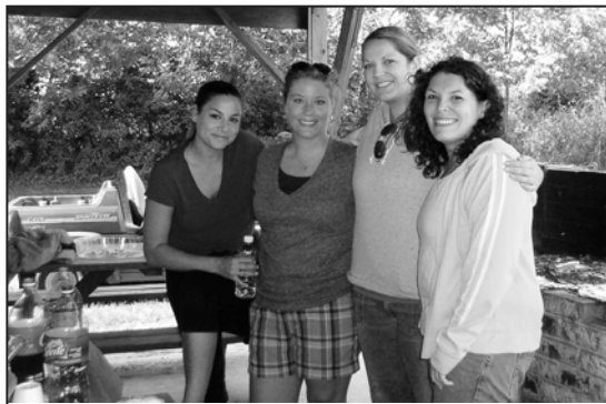
Members of the Ozanam Guild took a break from grilling to pause for a quick photo during their "Back to School BBQ" for Ozanam youth on September 25th. The boys and girls enjoyed a delicious meal and lots of fun games with these volunteers!