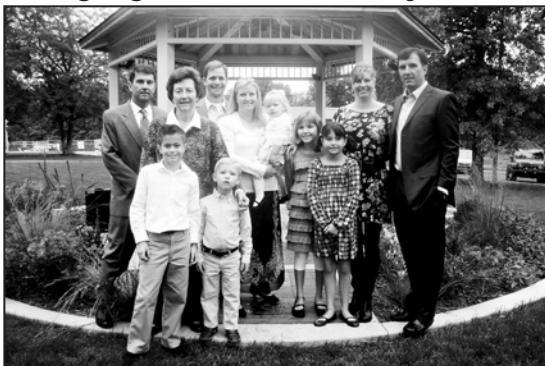
The Hart Family gathered together under the Gazebo named in their honor during its dedication on September 17th. This tranquil sitting area has become a focal point of our campus that provides a quiet place for children and visitors.