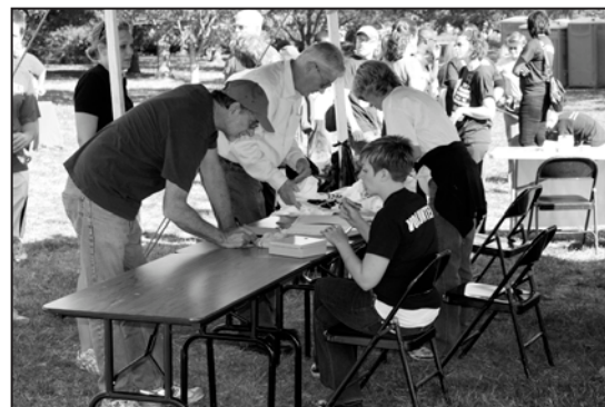
Walkers lined up to register for our very first "Step Into Their Shoes" Homeless Awareness Walk & 5k held on October 15th at Theis Park. Organized by our Pathways Program, this event raised awareness and funds for homeless youth!